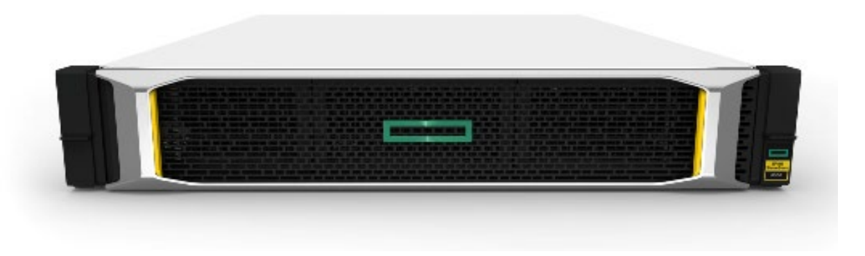
HPE MSA 2052 SAN Storage