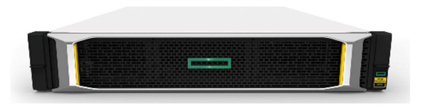
HPE MSA 1050 SAN Storage

Notes: *US Street Price (MSA 1050 base unit, dual 1GbE iSCSI controllers, four 300GB HDDs); prices are subject to change without notice.